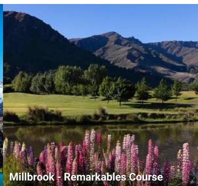
Millbrook - Remarkables Course