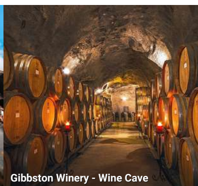
Gibbston Winery - Wine Cave