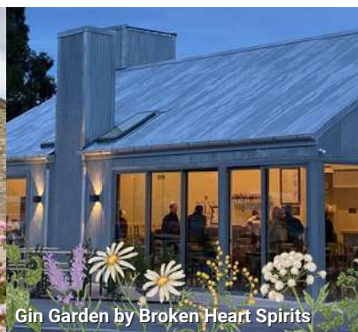
Gin Garden by Broken Heart Spirits