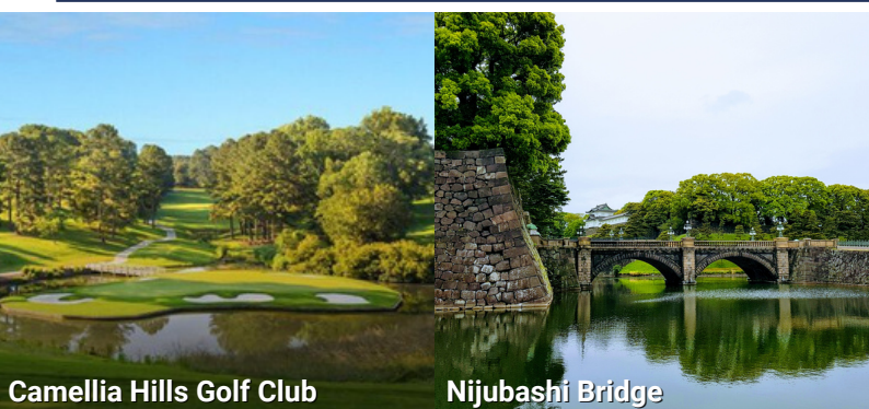
Camellia Hills Golf Club

(B, GL, D) HOTEL: Strings Intercontinental