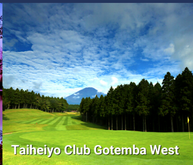
Taiheiyo Club Gotemba West