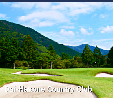
Dai-Hakone Country Club