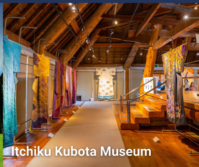
Itchiku Kubota Museum