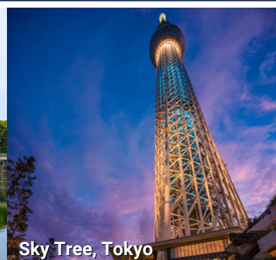
Sky Tree, Tokyo