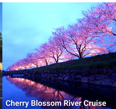
Cherry Blossom River Cruise