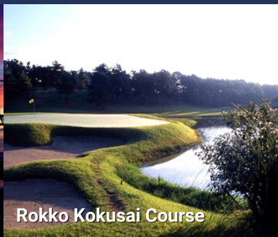
Rokko Kokusai Course