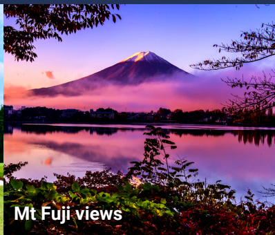
Mt Fuji views