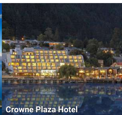
Crowne Plaza Hotel