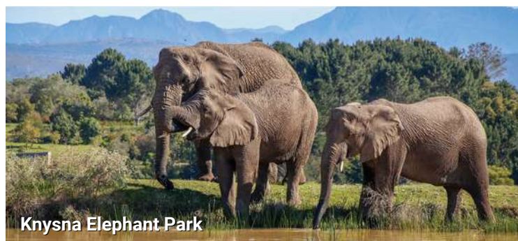
Knysna Elephant Park