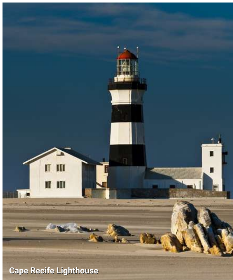
Cape Recife Lighthouse