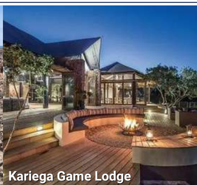
Kariega Game Lodge