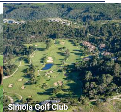
Simola Golf Club