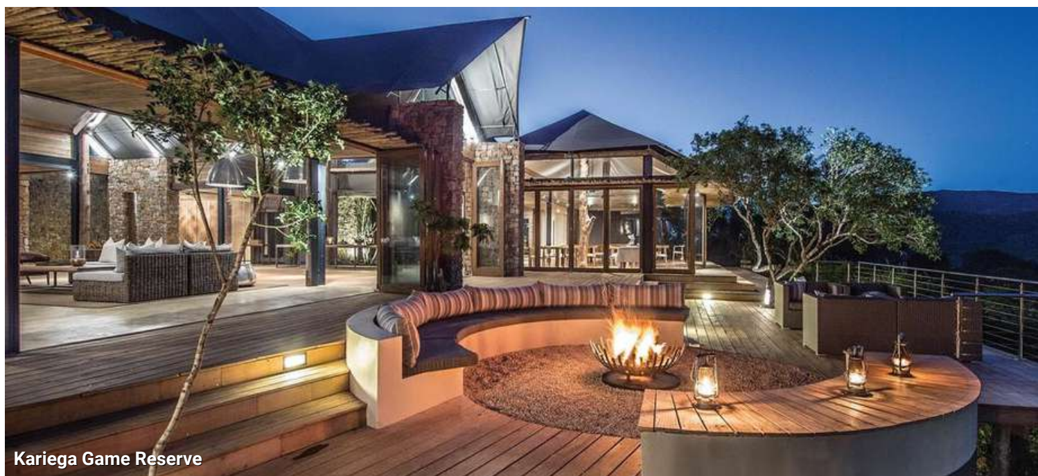
Kariega Game Reserve