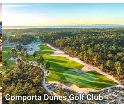
Comporta Dunes Golf Club