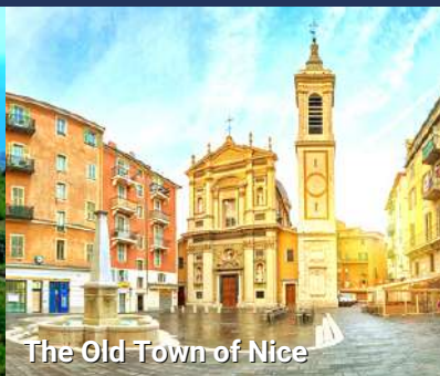
The Old Town of Nice