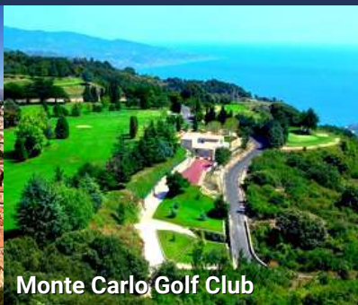
Monte Carlo Golf Club