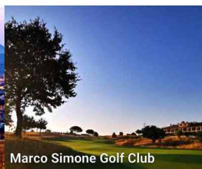
Marco Simone Golf Club