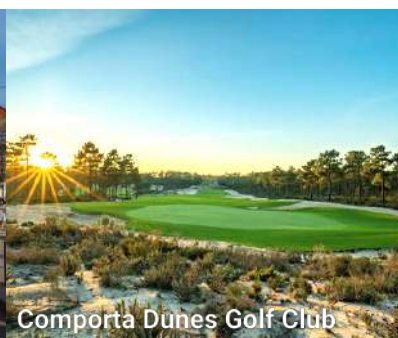
Comporta Dunes Golf Club