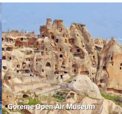
Goreme Open Air Museum