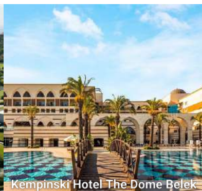
Kempinski Hotel The Dome Belek