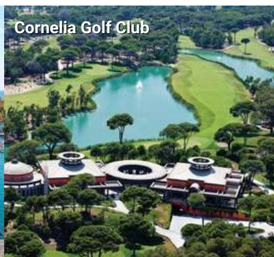
Cornelia Golf Club