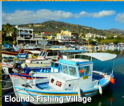
Elounda Fishing Village