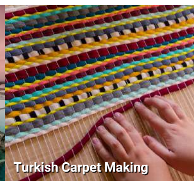
Turkish Carpet Making