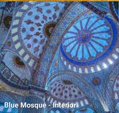
Blue Mosque - Interior