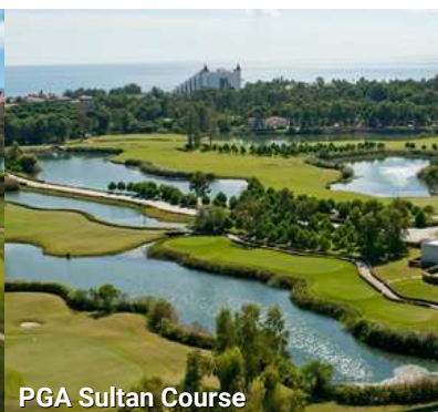
PGA Sultan Course