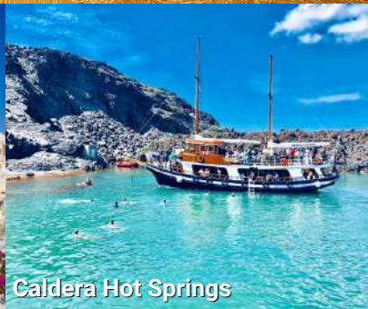
Caldera Hot Springs