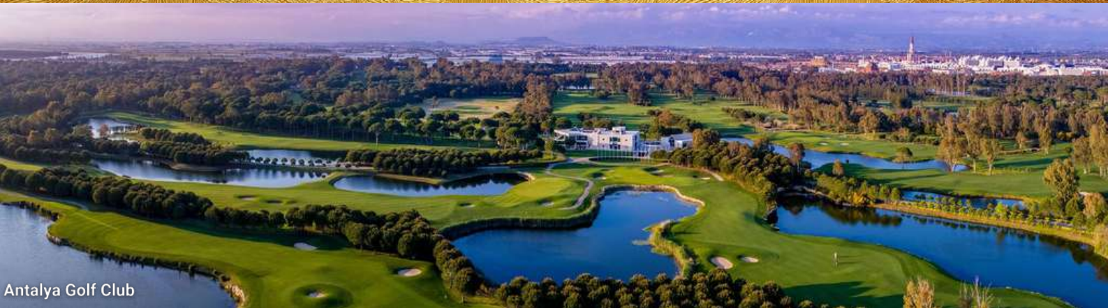
Antalya Golf Club