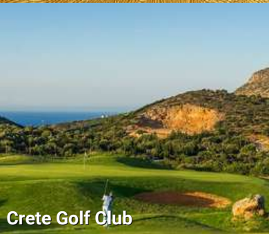
Crete Golf Club