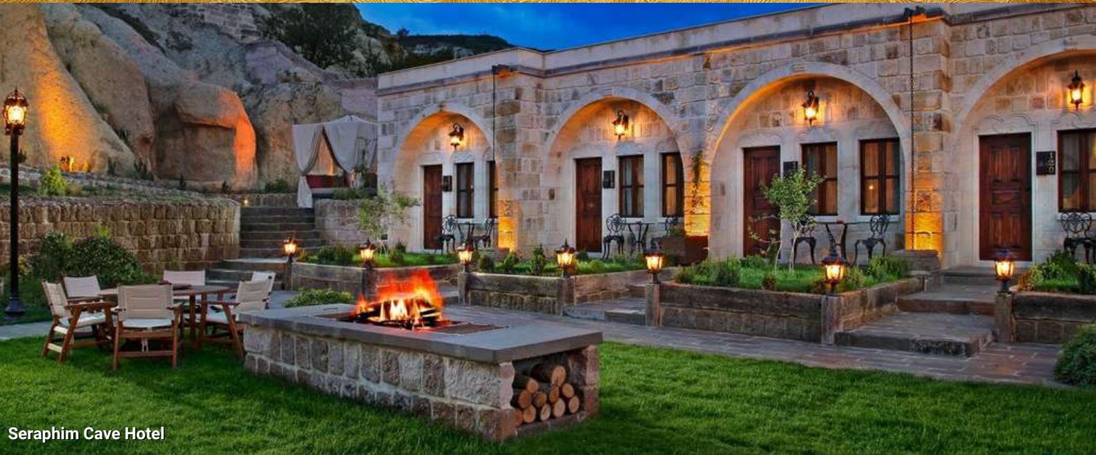
Seraphim Cave Hotel