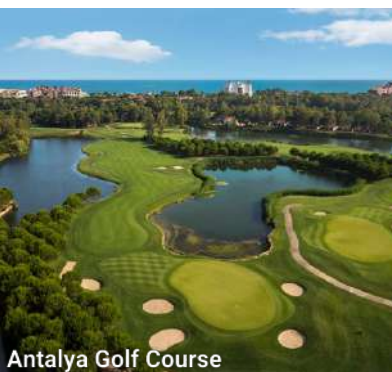
Antalya Golf Course