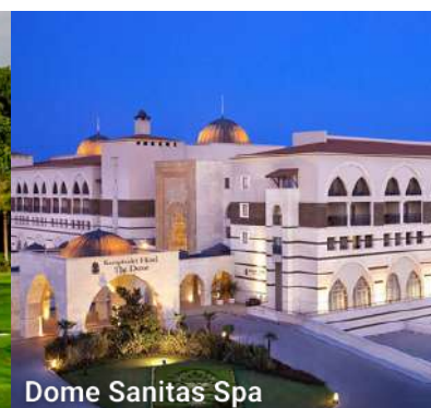
Dome Sanitas Spa