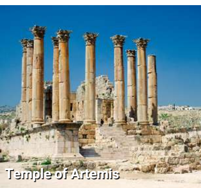
Temple of Artemis

(B) Hotel: Colossae Thermal Hotel, Pamukkale