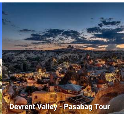
Devrent Valley - Pasabag Tour