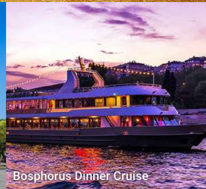
Bosphorus Dinner Cruise