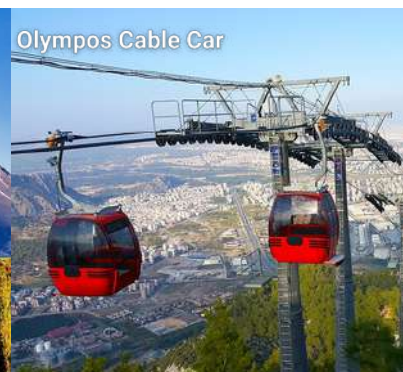
Olympos Cable Car