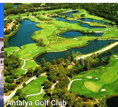
Antalya Golf Club