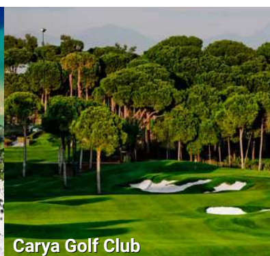
Carya Golf Club