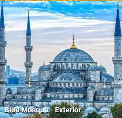
Blue Mosque - Exterior