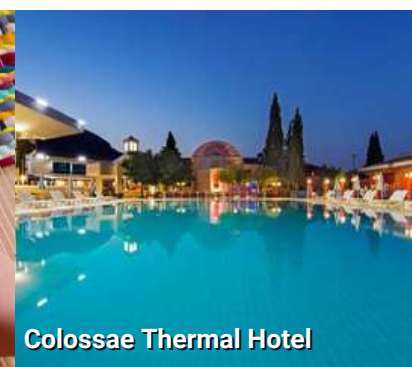
Colossae Thermal Hotel