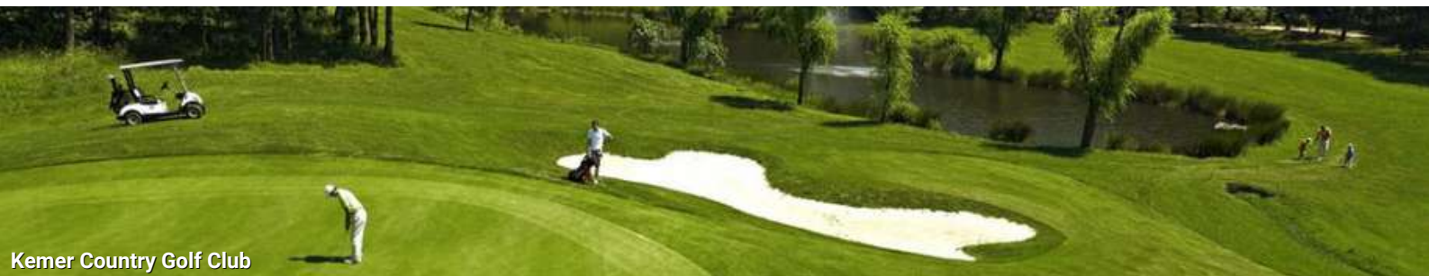
Kemer Country Golf Club