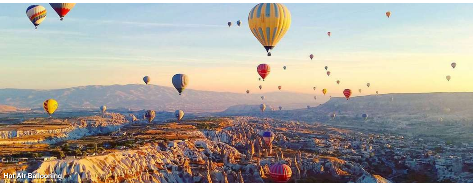
Hot Air Ballooning

(B) Hotel: Seraphim Cave Hotel, Cappadocia