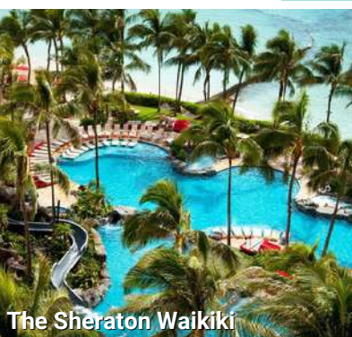
The Sheraton Waikiki

(B) Hotel: The Sheraton Waikiki, Honolulu