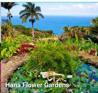
Hana Flower Gardens