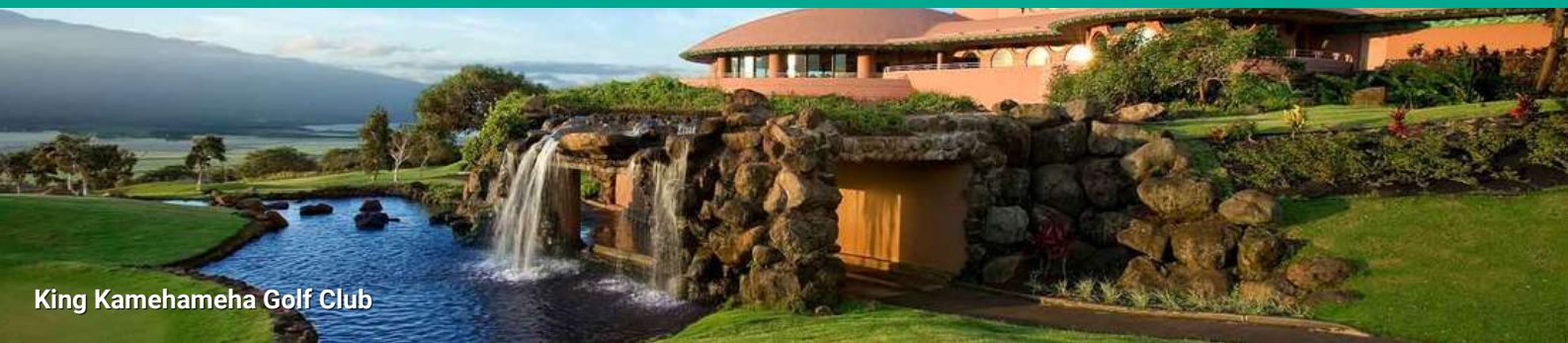
King Kamehameha Golf Club