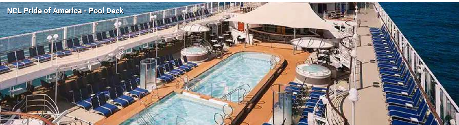
NCL Pride of America - Pool Deck

Serving a wide variety of culinary delights to please every palate, the complimentary dining options include two main dining rooms, a help-yourself buffet and a variety of casual cafés, grills and on-the-go choices. Plus, the Main Dining Rooms offer a menu that changes daily, Chef's Signature Dishes and carefully selected wine recommendations, guaranteeing a different culinary adventure with every visit.