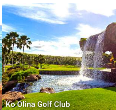
Ko Olina Golf Club