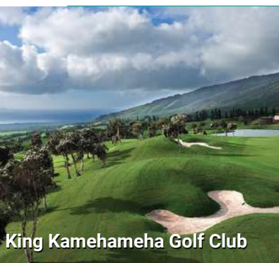
King Kamehameha Golf Club

(B, NGL, D) Cruise Ship: NCL - Pride of America