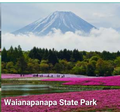
Waianapanapa State Park