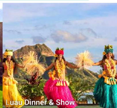
Luau Dinner & Show