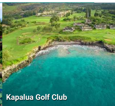
Kapalua Golf Club