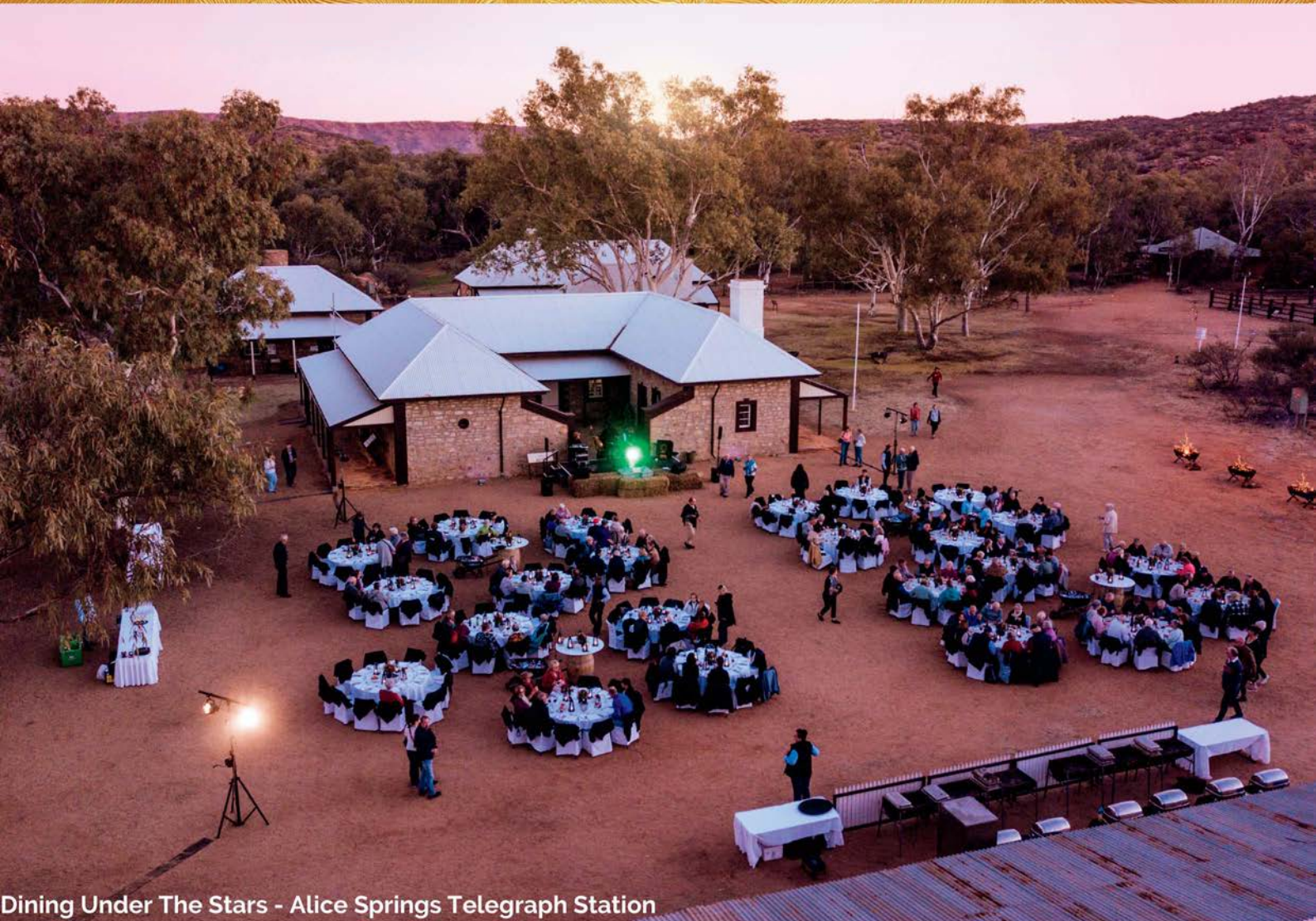
Dining Under The Stars - Alice Springs Telegraph Station

If this sounds like you and you would like to secure your spot on this trip of a lifetime, simply click below to be taken to our online booking form.