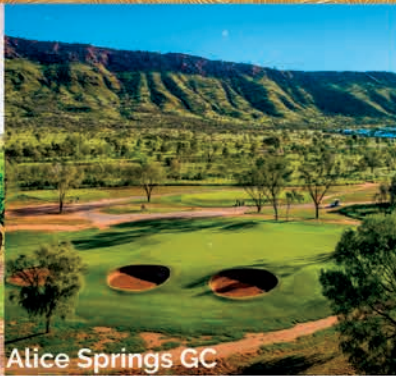
Alice Springs GC