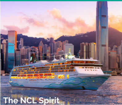
The NCL Spirit