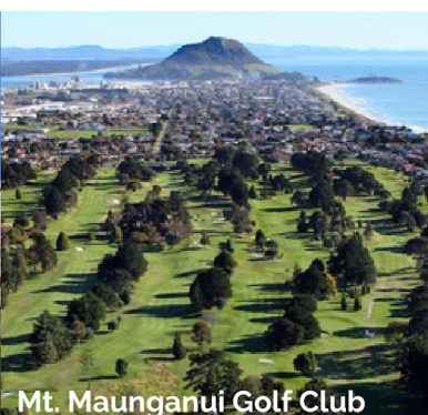
Mt. Maunganui Golf Club