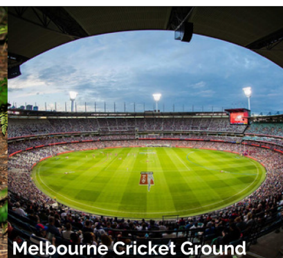
Melbourne Cricket Ground