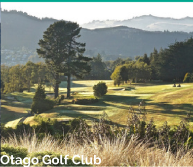
Otago Golf Club