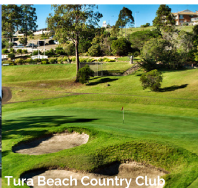
Tura Beach Country Club