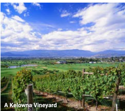
A Kelowna Vineyard