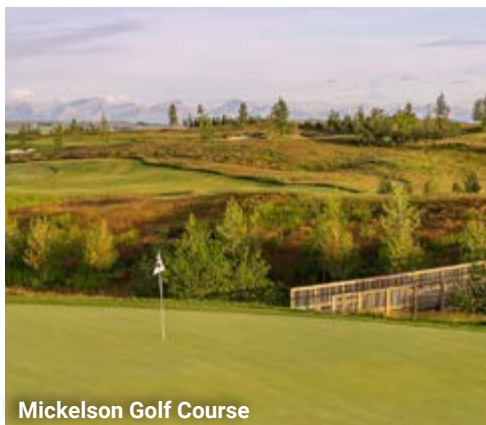
Mickelson Golf Course

"The western horizon only interrupted by iconic prairie vistas and wild horses on a path to snow-capped peaks. This is a golf course framed by rolling foothills with a raw natural aesthetic."