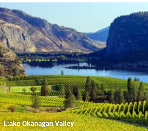
Lake Okanagan Valley