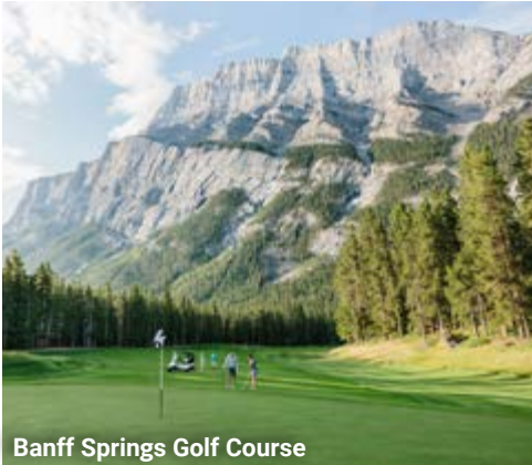
Banff Springs Golf Course

Savor your sumptuous breakfast at the hotel before the golfers leave to experience a truly special course.