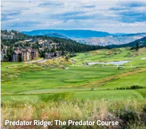
Predator Ridge: The Predator Course