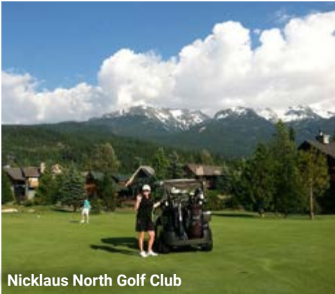
Nicklaus North Golf Club