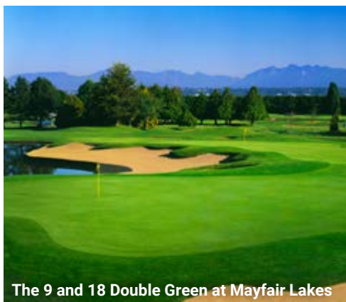
The 9 and 18 Double Green at Mayfair Lakes

After breakfast in the comfort of your hotel, the golfers will gear up for the short transfer to Mayfair Lakes Golf Club for a splendid day out.