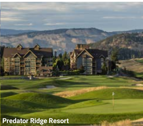
Predator Ridge Resort