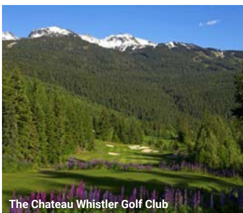
The Chateau Whistler Golf Club