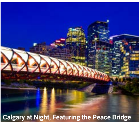
Calgary at Night, Featuring the Peace Bridge