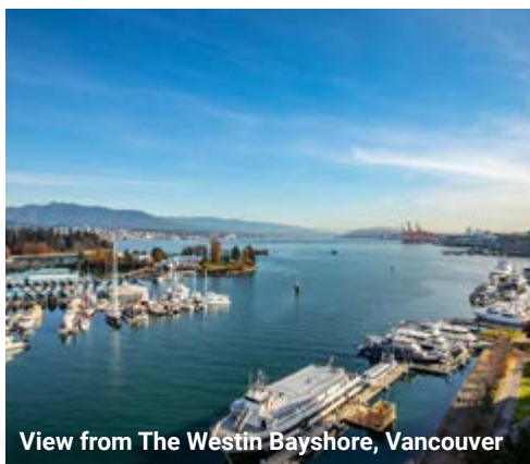
View from The Westin Bayshore, Vancouver