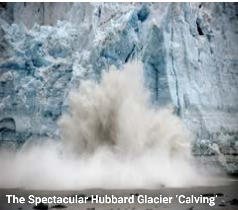
The Spectacular Hubbard Glacier 'Calving'