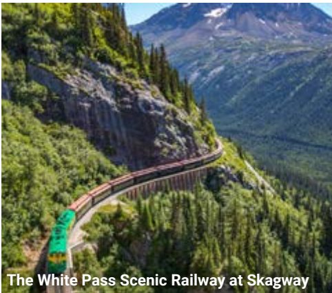
The White Pass Scenic Railway at Skagway