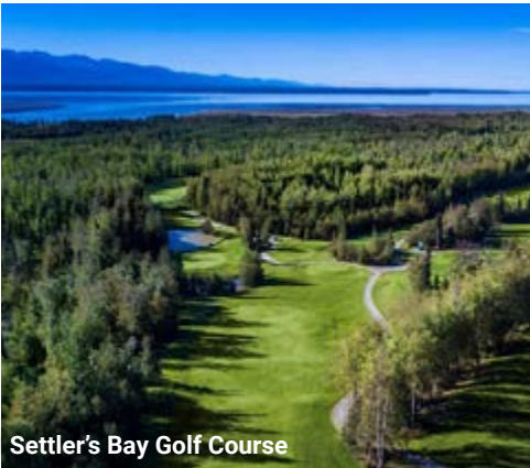
Settler's Bay Golf Course

We start the day at our home away from home - the Captain Cook Hotel, with breakfast, then the golfers will have an opportunity to play a truly special course.