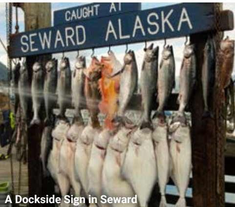
A Dockside Sign in Seward

We enjoy a comforting breakfast at our hotel before the golfers are treated to a golf course known for its scenery and local wildlife..