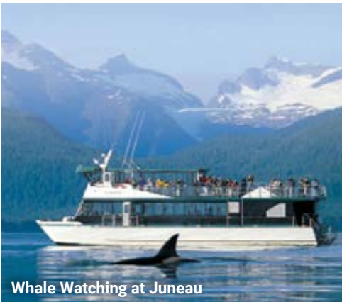
Whale Watching at Juneau