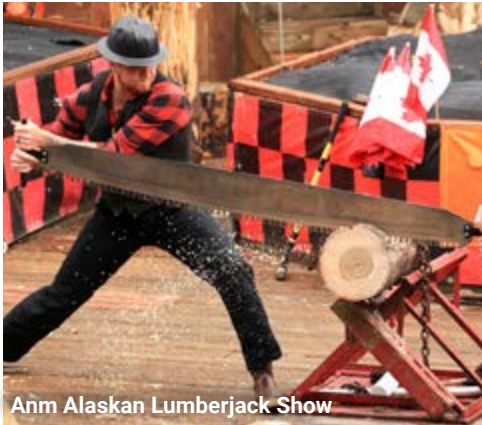
Ann Alaskan Lumberjack Show