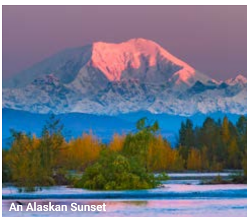
An Alaskan Sunset

(B, L, D) Cruise Ship: NCL Norwegian Jewel