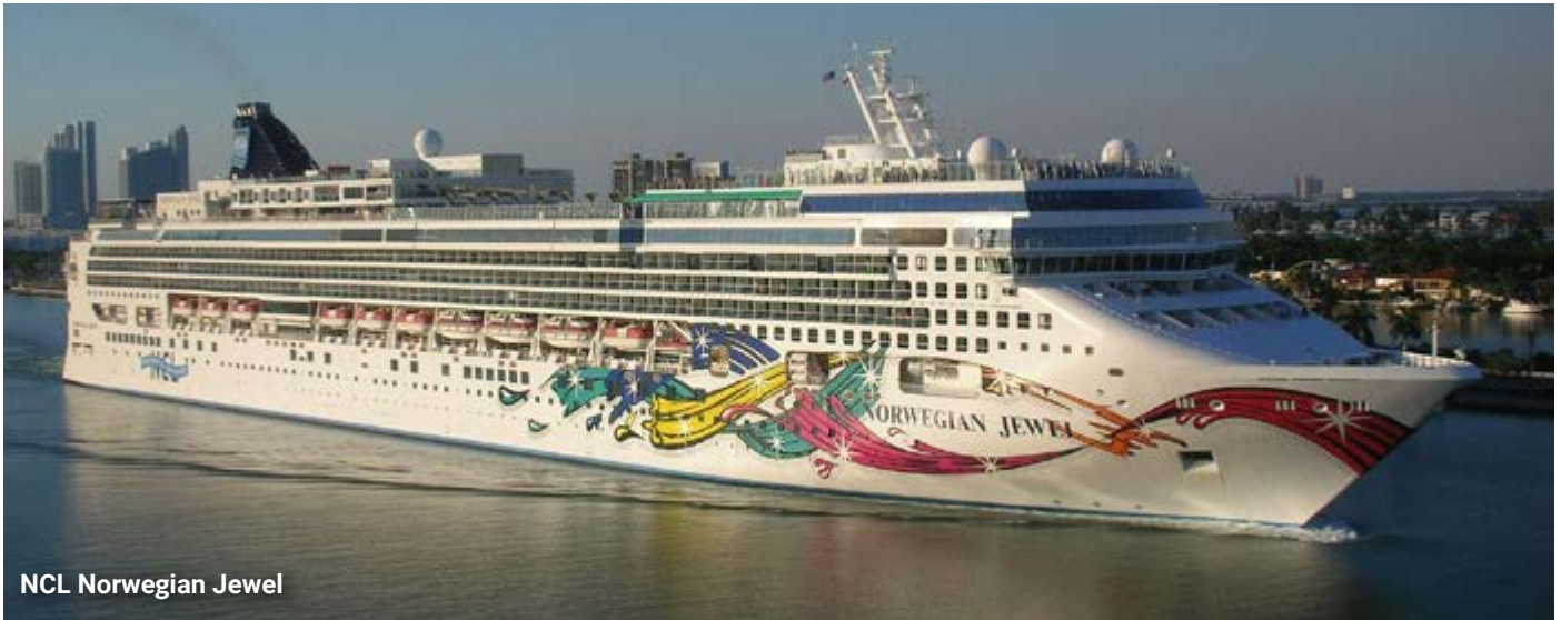
NCL Norwegian Jewel

After its two-week renovation period in Sydney for one of the most extensive renovations across the fleet in 2018, the namesake of NCL's "Jewel Class" cruise ships, the Norwegian Jewel has a large variety of dining options, vibrant bars and nightclubs, and that's just the beginning.