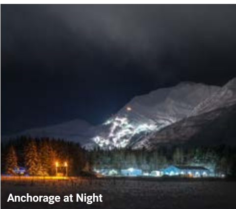
Anchorage at Night