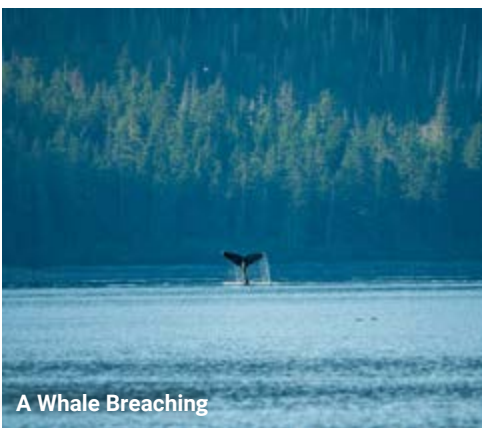
A Whale Breaching