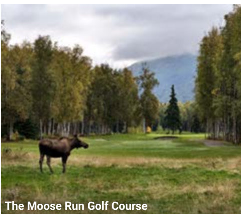
The Moose Run Golf Course

"The Creek Course opened in 2000 and is the most challenging golf course in the state ... It's the longest golf course in Alaska at 7,324 yards from the back tees, and has the Longest Single Hole, the par 5, number 11 at 640 yards. Two of the holes, # 6 and 11, play through reclaimed gravel pits and are two of most scenic holes to be found in Alaska."