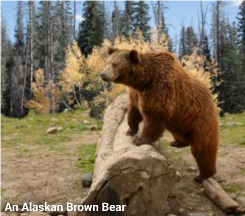
An Alaskan Brown Bear