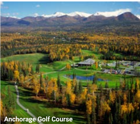
Anchorage Golf Course