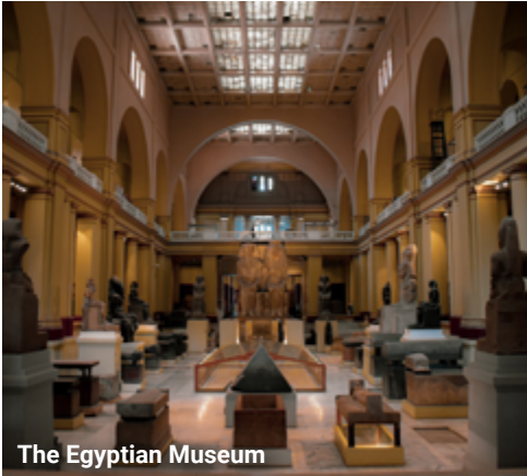
The Egyptian Museum

Non-golfers have a day to relax and explore the surrounds. This evening we'll all join up for the Cairo By Night City Tour with dinner at a local restaurant.