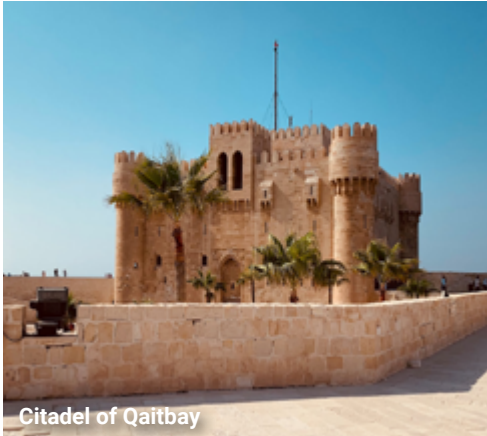
Citadel of Qaitbay