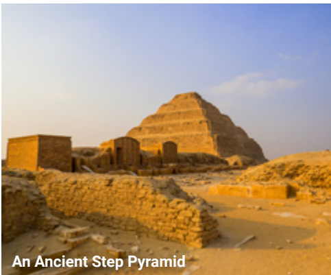
An Ancient Step Pyramid