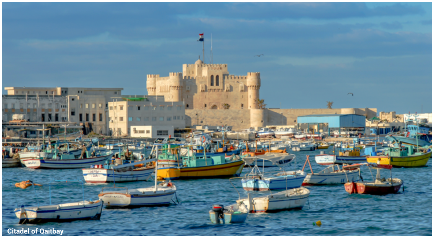
Citadel of Qaitbay

27 - 30 SEPTEMBER 2023 | 3 DAYS | NON-ESCORTED