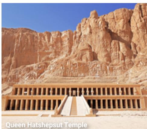
Queen Hatshepsut Temple

(B,L,D) Cruise Ship: Mövenpick Ms Hamees