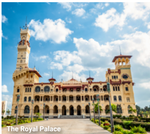
The Royal Palace