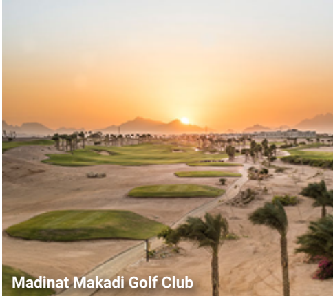
Madinat Makadi Golf Club