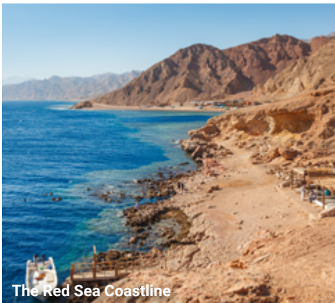
The Red Sea Coastline

With over seventy-five hundred yards 6880 metres from the Championship tees to the middle of the green the course challenges the best players in the world. The course has also six sets of tees to accommodate all levels of golfers from beginners to touring professionals.