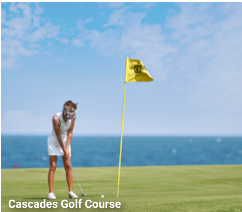
Cascades Golf Course