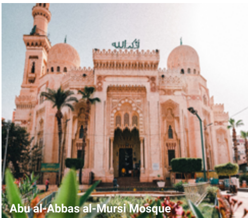
Abu al-Abbas al-Mursi Mosque