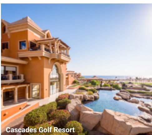
Cascades Golf Resort

(B,L,D) Cruise Ship: Mövenpick Ms Hamees