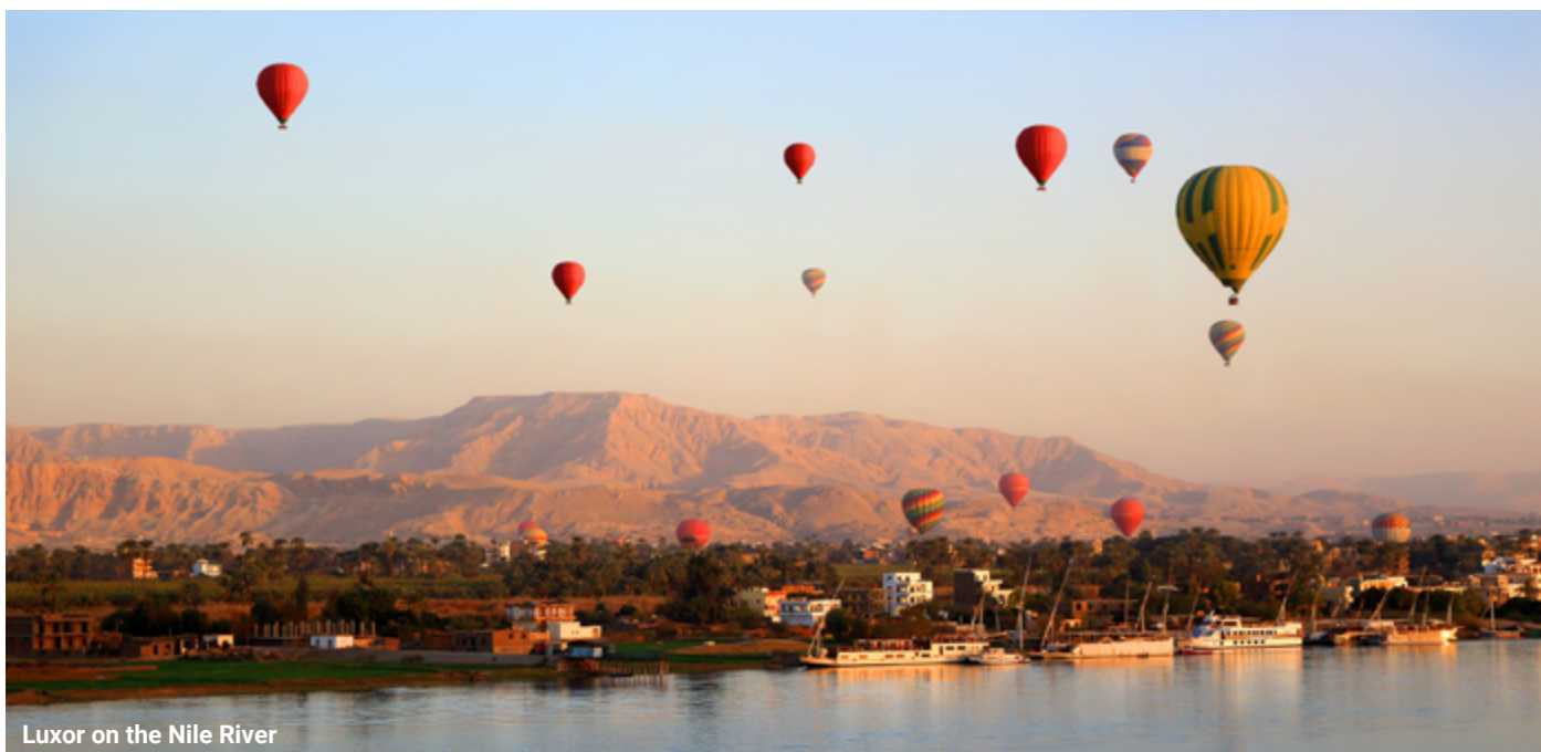
Luxor on the Nile River