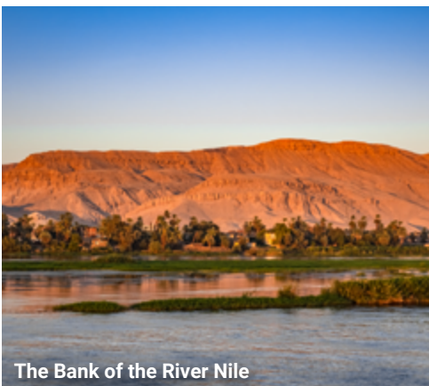
The Bank of the River Nile