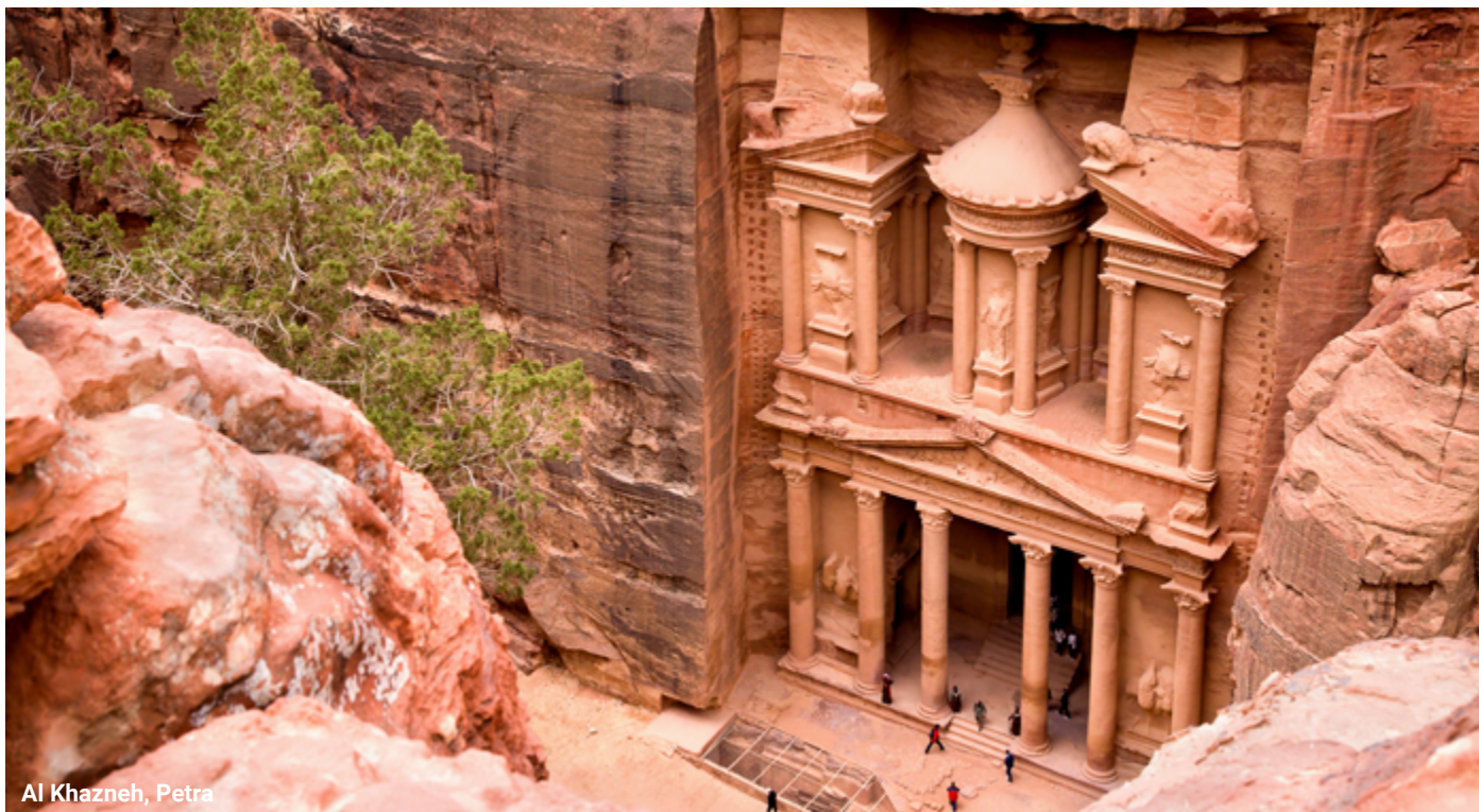
Al Khazneh, Petra

12 - 17 OCTOBER 2023 | 6 DAYS | NON-ESCORTED