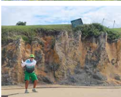
A bunker at the Quarry course