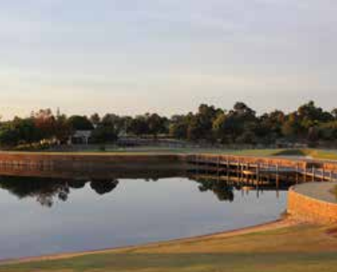
Dunsborough Lake Golf Club