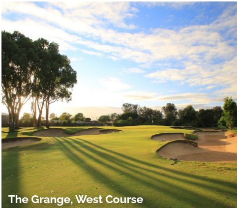
The Grange, West Course

It's time to say your goodbyes. After breakfast, you'll be transferred back to Adelaide for your flight home. We suggest a departure time after 11:30am. (B)