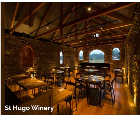
St Hugo Winery