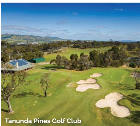
Tanunda Pines Golf Club