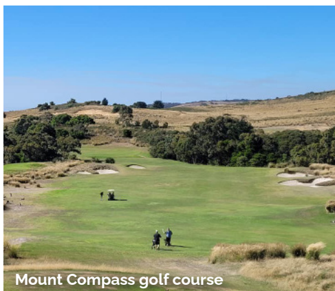
Mount Compass golf course