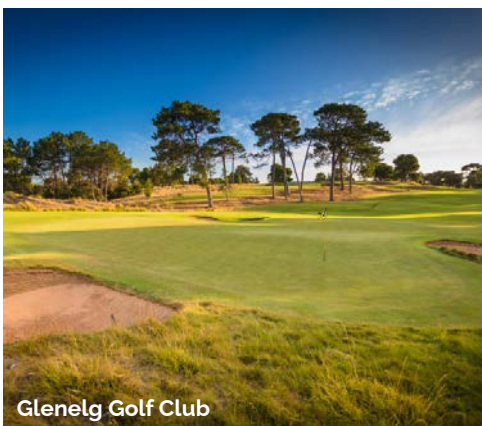
Glenelg Golf Club