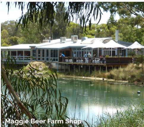
Maggie Beer Farm Shop