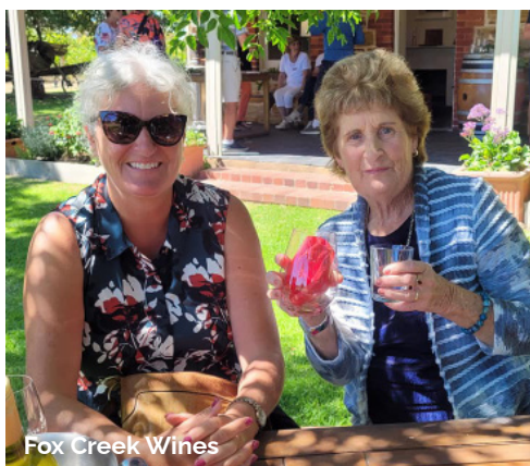
Fox Creek Wines