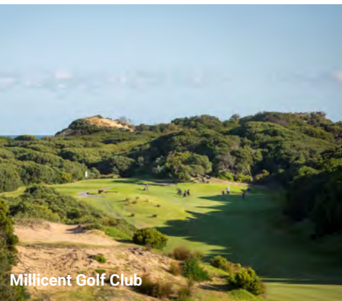
Millicent Golf Club