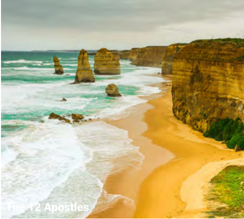
The 12 Apostles