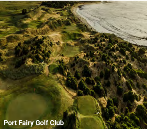
Port Fairy Golf Club

(B, L, D): The Southgate Motel, Mt Gambier