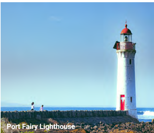
Port Fairy Lighthouse