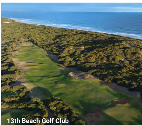
13th Beach Golf Club