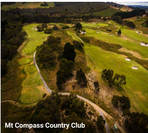
Mt Compass Country Club