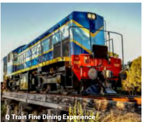
Q Train Fine Dining Experience