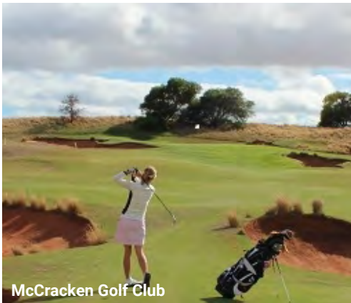
McCracken Golf Club