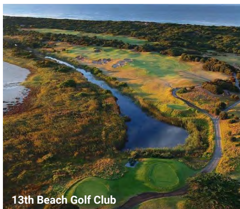
13th Beach Golf Club

(B, L) Hotel: The Novotel Geelong, Geelong