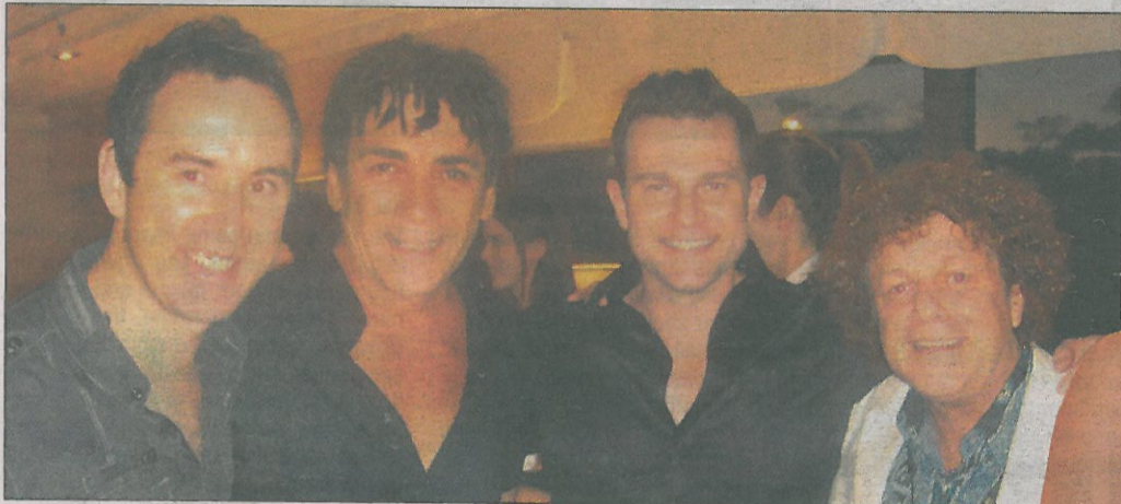
Damien Leith, Mark Williams, David Campbell and Leo Sayer